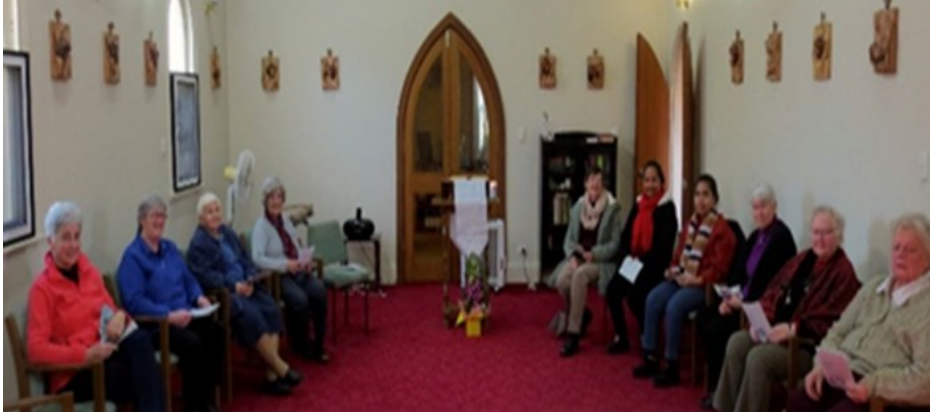
Good Samaritan Sisters 2021 celebrating 145 years in Windsor on the anniversary of the laying of the foundation stone of their 142 year old Chapel by Archbishop Vaughan.

Windsor was one of the first three towns in Australia. John Bede Polding, the first Bishop of Australia travelled there in April 1836 just months after his arrival in the colony. He wrote to his cousin at Downside: